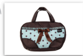
THE TIFFANY - STYLE 3106