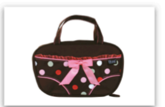
THE EMILY - STYLE 3105