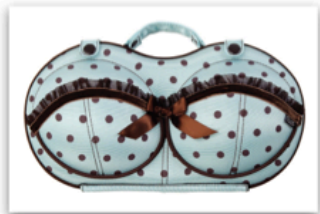
THE TIFFANY - STYLE 1106