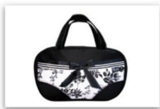
THE TOSCA - STYLE 3107