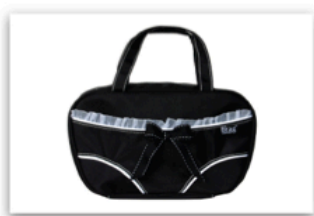
THE SOPHIA - STYLE 3103