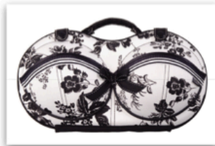
THE TOSCA - STYLE 1107