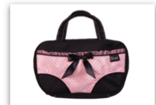
THE KATIE - STYLE 3101

Panty Pak: Designed with two inside pouches to separate your "clean" from "not so clean" panties, this lightweight travel case is the perfect travel companion and is sure to keep you organized wherever you go!