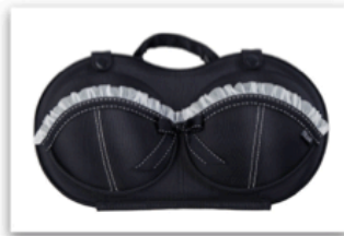
THE SOPHIA - STYLE 1103