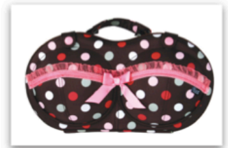
THE EMILY - STYLE 1105