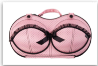
THE KATIE - STYLE 1101

Bra Bag: This adorable travel case, shaped like a bra, protects molded bras from denting or lumping in your suitcase so they arrive in form. Available in more than six darling styles, the Bra Bag can store up to six bras cup sizes A-C. The Bra Bag has been touted by A-listers and fashion magazines around the world.