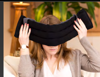
Easy Velcro Closure