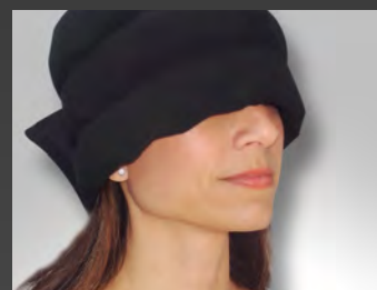
Blocks Out Light