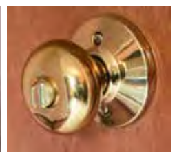
Knob Locks are Weak