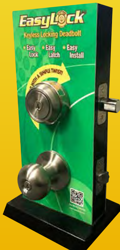
POP Display 13"H X 5.5"W X 5.125"D